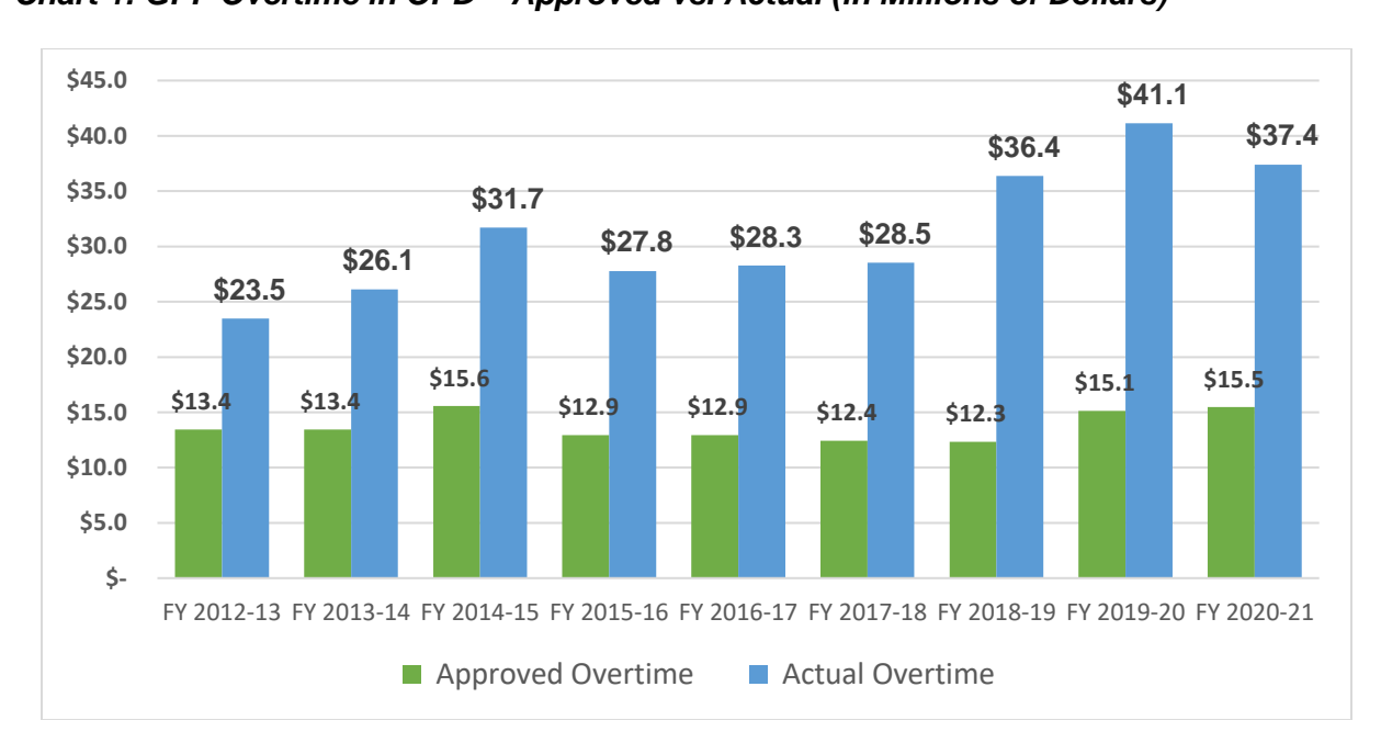
Chart 1: GPF Overtime in OPD – Approved vs. Actual (in Millions of Dollars)

Chart 1 below provides a summary on budgeted (approved) overtime expenses in comparison to actual overtime expenses from FY 2012-13 through FY 2020-21 (the FY 2020-21 actual amount is a projection as the fiscal year has not ended).